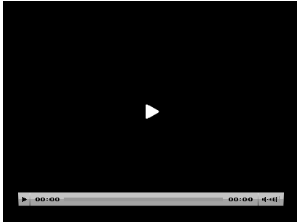
The Lexus LF-Ch Concept.